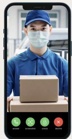
Visitor Web Intercom